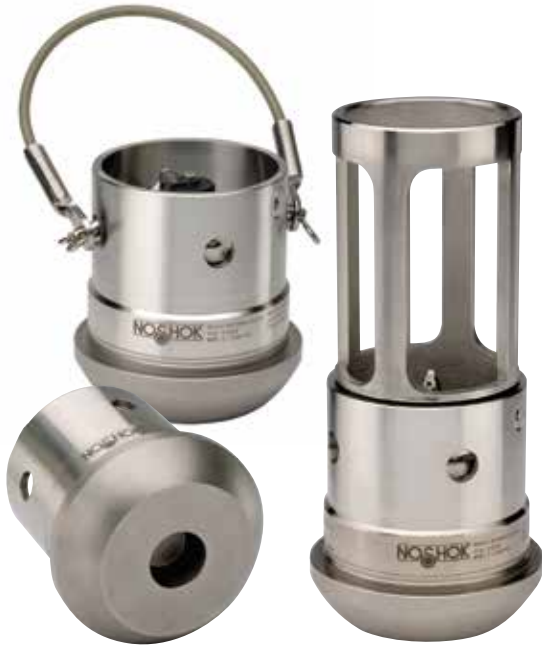
Shown with optional Electrical Connector Cage