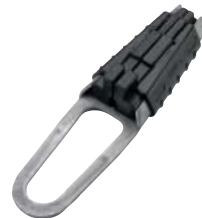
Optional Cable Clamp