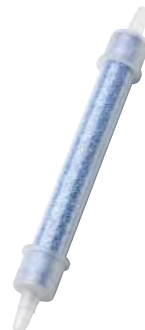
Optional Desiccant Cartridge