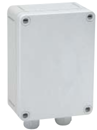
Optional Cable Junction Box