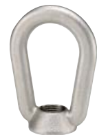
Optional Lifting Ring