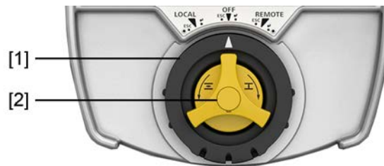
Figure 1: Combi-Switch (selector switch and shuttle dial)

[1] Selector switch (outside, black ring)