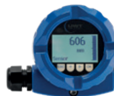
Lid with viewing window